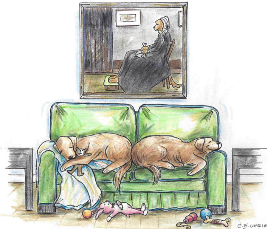
Whistler's Family 'From chair to couch in three generations'