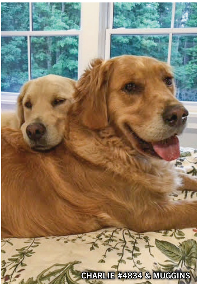
CHARLIE #4834 &amp; MUGGINS

Follow Louise Penny, our spokesperson, on Facebook HERE!